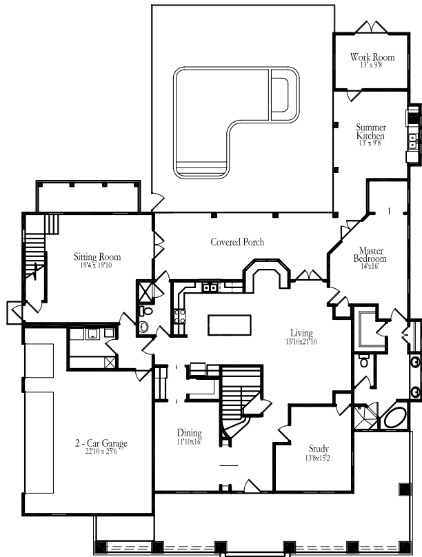
Floor Plan N.T.S