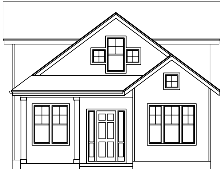
Front Elevation N.T.S

Advanced Building Concepts bob@advancedbuildingconceptsinc.com 352-379-0898 CGC 1511811