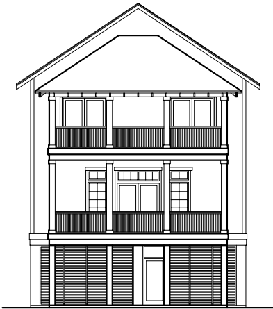
Front Elevation N.T.S