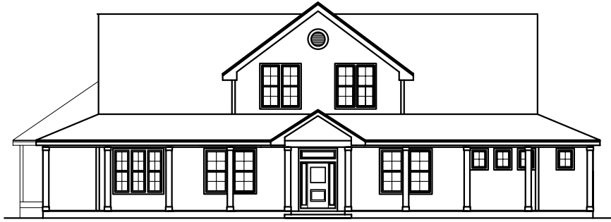
Front Elevation N.T.S