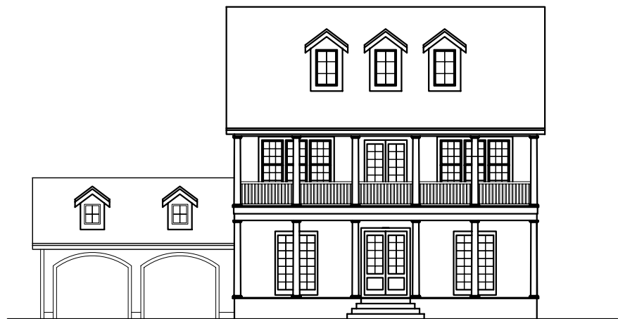
Front Elevation N.T.S