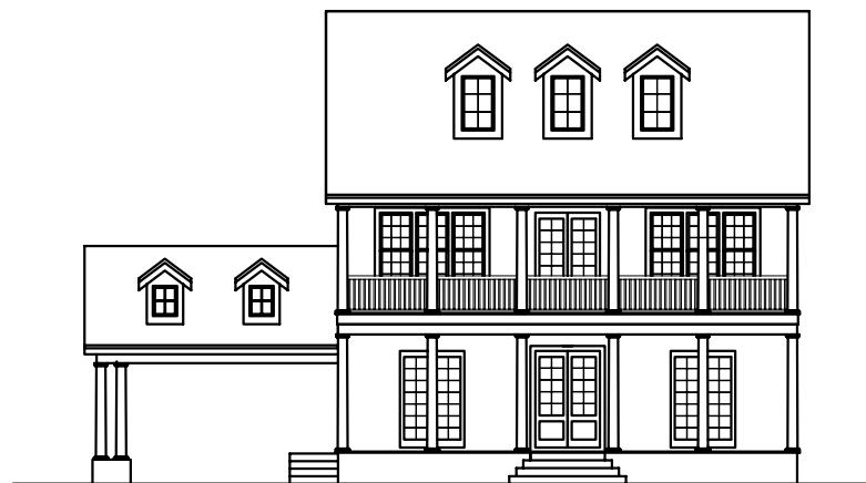
Front Elevation N.T.S