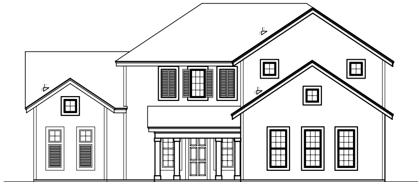
Front Elevation N.T.S