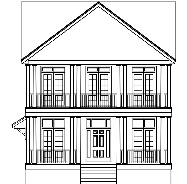
Front Elevation N.T.S