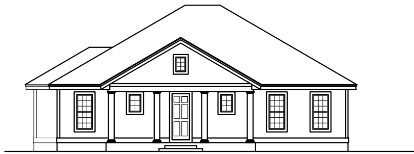
Front Elevation N.T.S